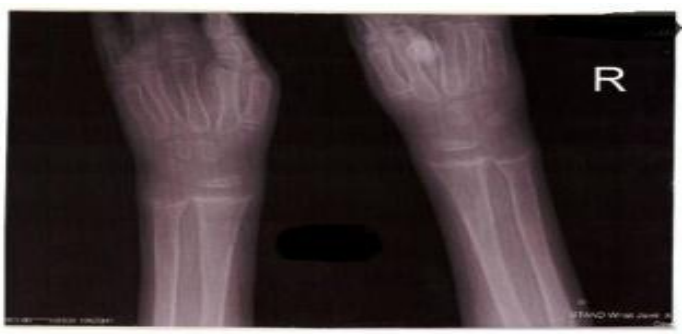
Fig: 4 Hand wrists X-ray shows frying and cupping of distal ulnar and radius.