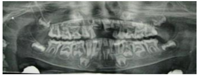
Fig: 3 Orthopantamogram shows enamel agenesis.